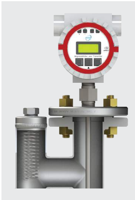
Compact Close Coupled Chambers